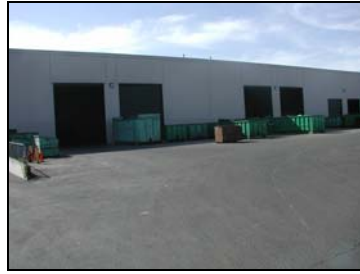
Tipping Building – Canby TS