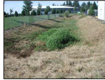
Stormwater Swale – Canby TS

Ultimate disposal will be at the Riverbend Landfill, a Waste Management-owned company. The Riverbend Landfill first came into use during the mid-eighties. When Riverbend became a Subtitle D landfill in 1993, the original unlined cells were capped. Since 1993, the landfill has been filling only lined cells and operating with the required environmental controls required by the Oregon Department of Environmental Quality (DEQ). The landfill has no known history of landfilling wastes that pose a future risk of environmental contamination.