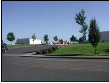
Entrance – Canby TS

and services only affiliated hauling companies. Staff is not aware of any wastes accepted at CTR that could pose a risk of environmental contamination.