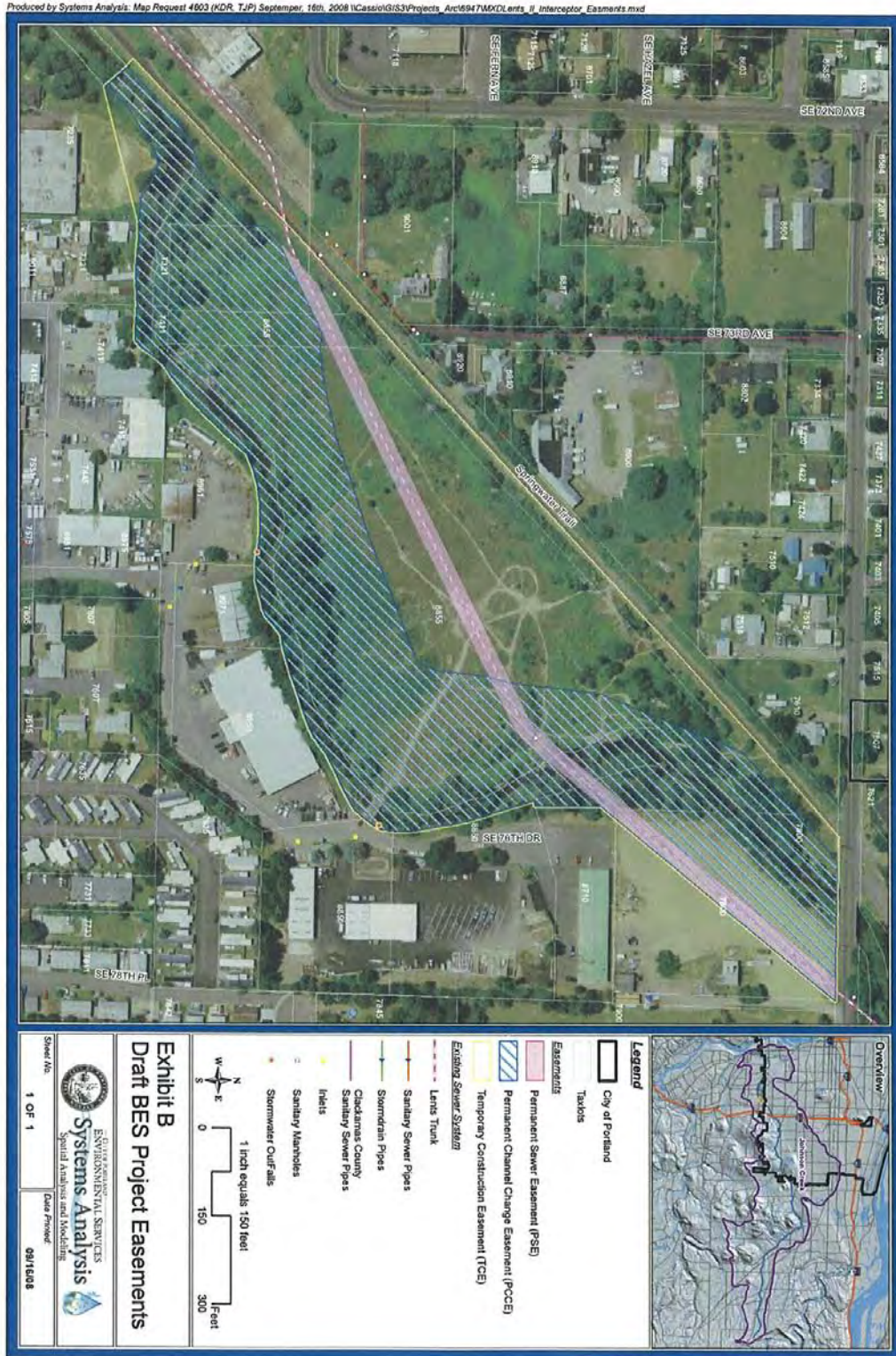
EXHIBIT B Easement Diagram