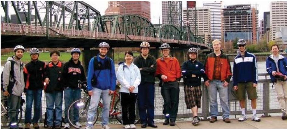
OSU students took a bike tour of Portland in April 2009 to see innovative bike designs around the city