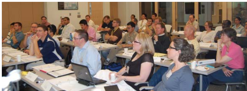
Teachers became students again at the OTREC/NIATT Transportation Education Conference at Portland State University in June 2009.

The Transportation Research Board's 89th Annual Meeting will be held January 10-14. As usual, OTREC faculty and students will be actively involved throughout the conference. Keep your eye out for a special "OTREC at TRB" publication with details about the Region X Reception and presentations by OTREC faculty and students.