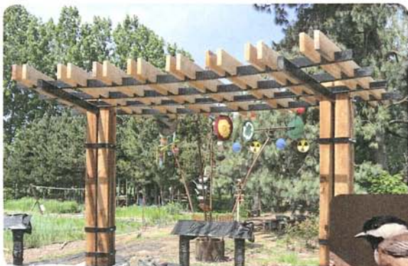
CREST trailhead plaza with gardens and student-designed mobile.