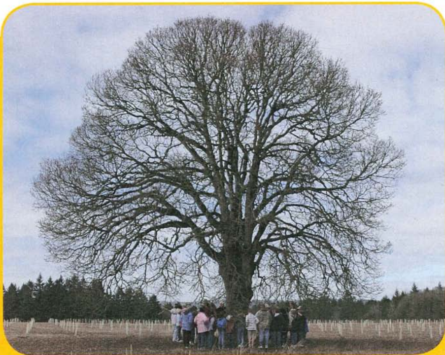
Students at the lone oak tree, Graham Oaks Nature Park

Graham Oaks Nature Park Grand opening celebration 10 a.m. to 2 p.m. Saturday, Sept. 18, 2010 Wilsonville