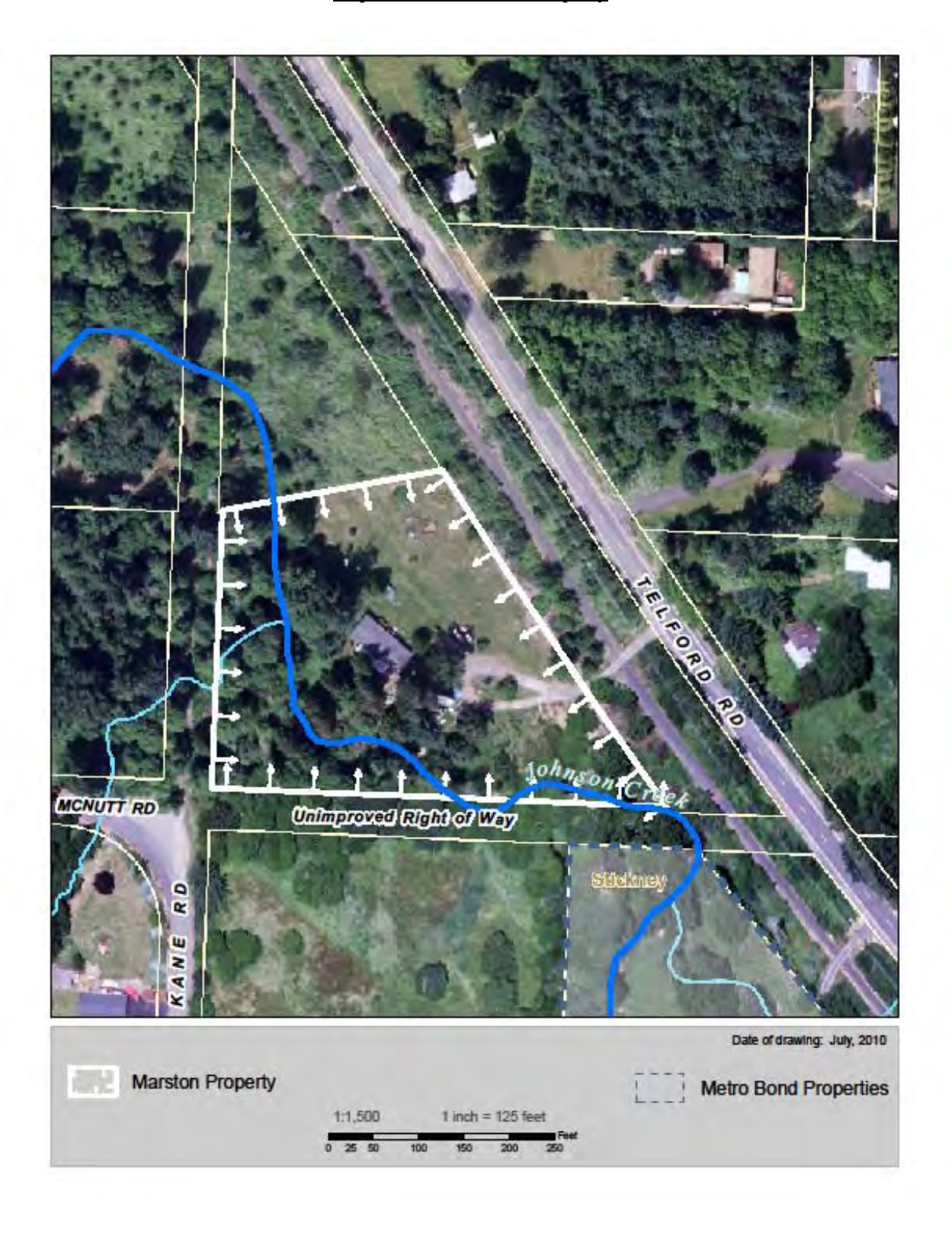
Page 1 of 1 - Exhibit B to Resolution No. 10-4171