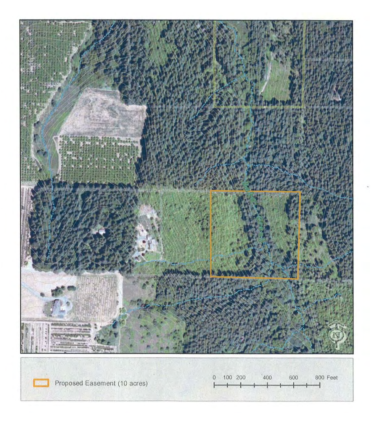
Exhibit B Depiction of Easement Area