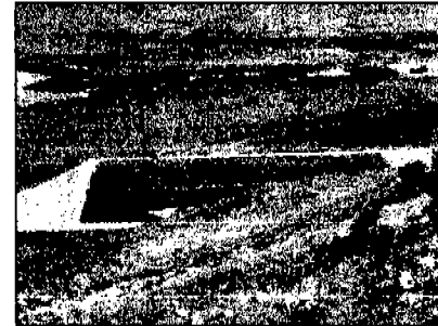
Newly Lined Cell