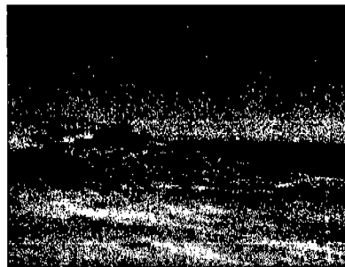
Working Face of Landfill