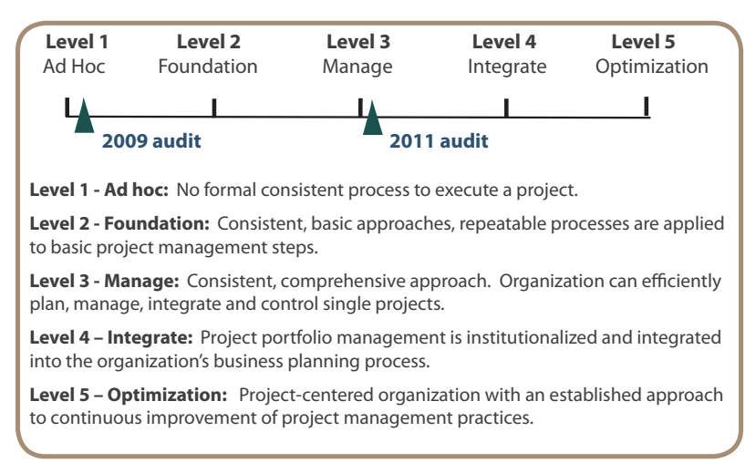
Exhibit 2: Level of project management capability and maturity 2009 and 2011 audits

Bond Program had effectively managed three separate construction projects. Furthermore, Metro was in the process of developing a master plan that would provide a blueprint for the complex series of future projects to come.