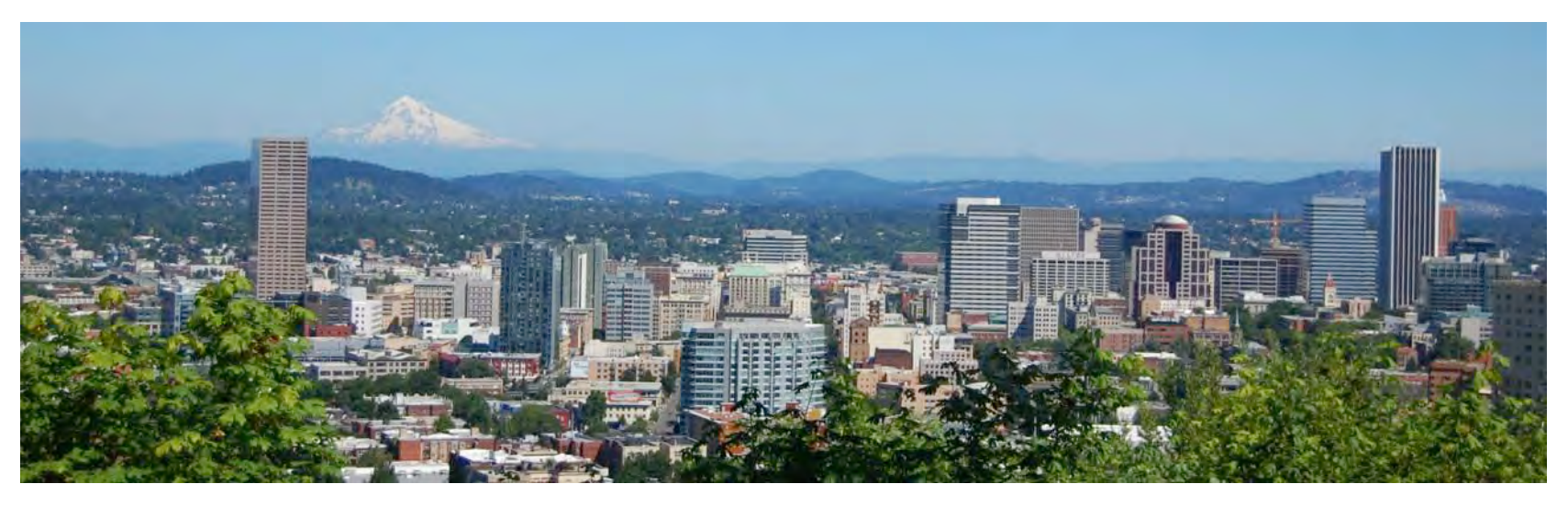
Portland today: 16 years without an air quality violation