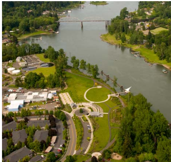
Lake Oswego's Foothills District