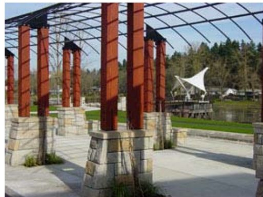
In Lake Oswego, Foothills Park features sweeping views of the Willamette River, a timber and stone picnic pavilion with a stone fireplace, pathways, and a grass amphitheater