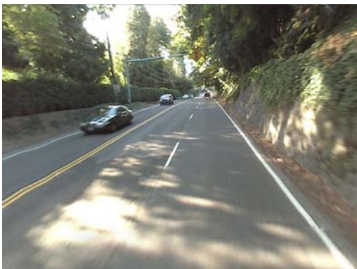
Highway 43 north of Lake Oswego has no existing facility for bicycles and pedestrians