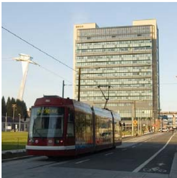
In the north, the trail leads to South Waterfront, connecting to OHSU via the aerial tram