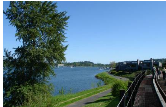
This corridor provides outstanding views along the Willamette River in Johns Landing