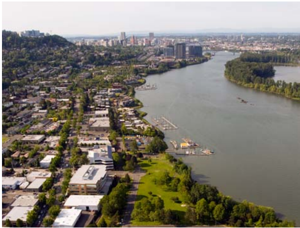
Portland's Johns Landing District

There are three subsections in the corridor (see attached maps): a North Segment spanning from the South Waterfront District to the Sellwood Bridge, a Central Segment spanning from the Sellwood Bridge to the City of Lake Oswego, and a South Segment in the City of Lake Oswego, including the downtown and Foothills Park.