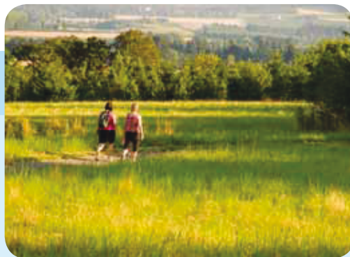
Cooper Mountain Nature Park

10695 SE Mather Road, Clackamas 503-742-4353