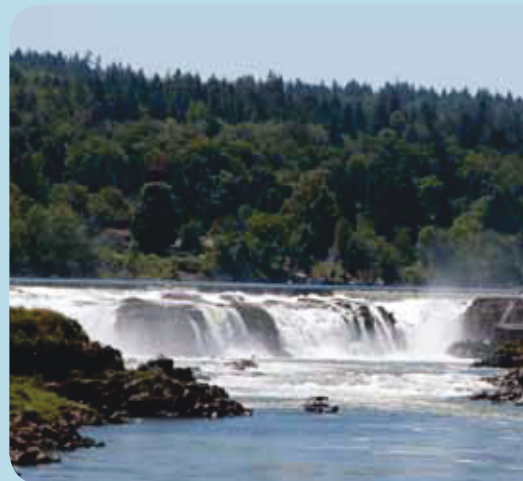
Willamette Falls, looking toward Canemah. These falls were a major trade site for Native Americans throughout the Northwest.

To learn more about the Canemah Historic District, visit www.orcity.org/planning/canemah-national-register-district .