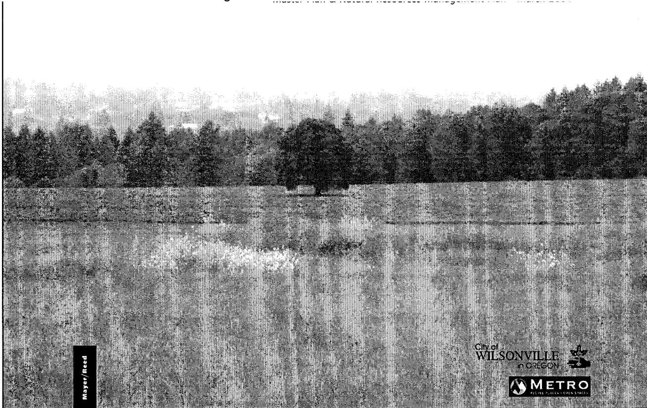
EXHIBIT B to RESOLUTION NO. 04-3462 Wilsonville Tract Master Plan & Natural Resources Management Plan - March 2004