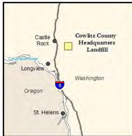
Site location for the Cowlitz County Headquarters Landfill located in Castle Rock, Washington

On October 17, 2014, Metro received an application from the Cowlitz County Department of Public Works requesting that the Cowlitz County Headquarters Landfill be recognized by Metro as a designated facility of Metro's solid waste system under the provisions of Metro Code Chapter 5.05.