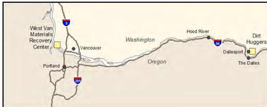
Site location for West Van located in Vancouver, and Dirt Huggers located in Dallesport, Washington

The applicant seeks authorization to transport residential food waste mixed with yard debris and commercial food waste generated within the Metro region to a non-system facility, West Van, for transfer to the Dirt Hugger facility for composting. Both facilities are located outside the region. Metro Code Section 5.05.025 prohibits any person from transporting solid waste to non-system facilities without an appropriate license from Metro. The proposed NSL is subject to Metro Council approval because it involves putrescible waste (food waste).