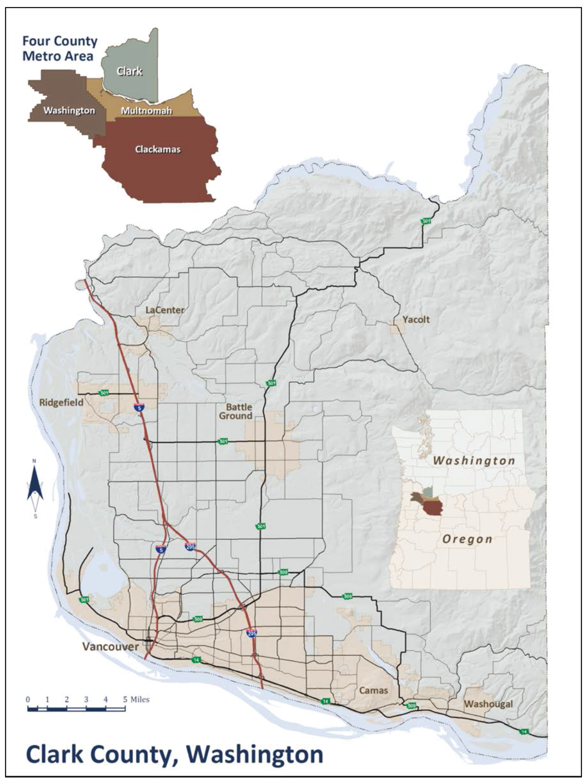
Figure 1: RTC, Metropolitan Planning Organization (MPO) The Metropolitan Planning Area (MPA)/MPO region includes the whole of Clark County