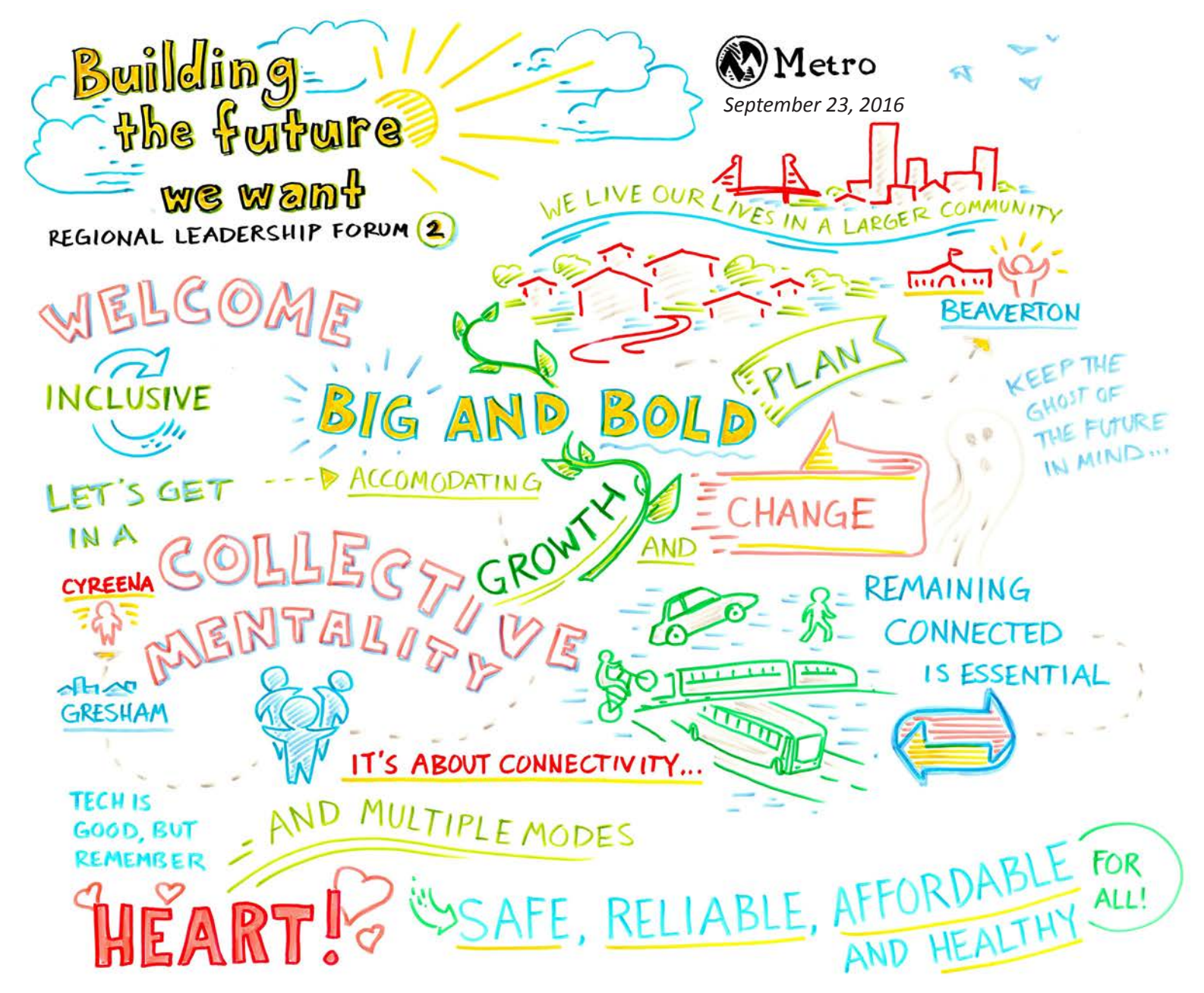
Regional Leadership Forum 2 | Building the Future We Want | Oregon Convention Center, Portland OR | Sept. 23, 2016

The Metro Council convened MPAC, JPACT and community and business leaders to foster leadership and collaboration to address regional transportation challenges through the 2018 Regional Transportation Plan. Working together across interests and communities can help ensure every person and business in the Portland metropolitan region has access to safe, reliable, affordable and healthy ways to get around. Find out more at oregonmetro.gov/rtp .