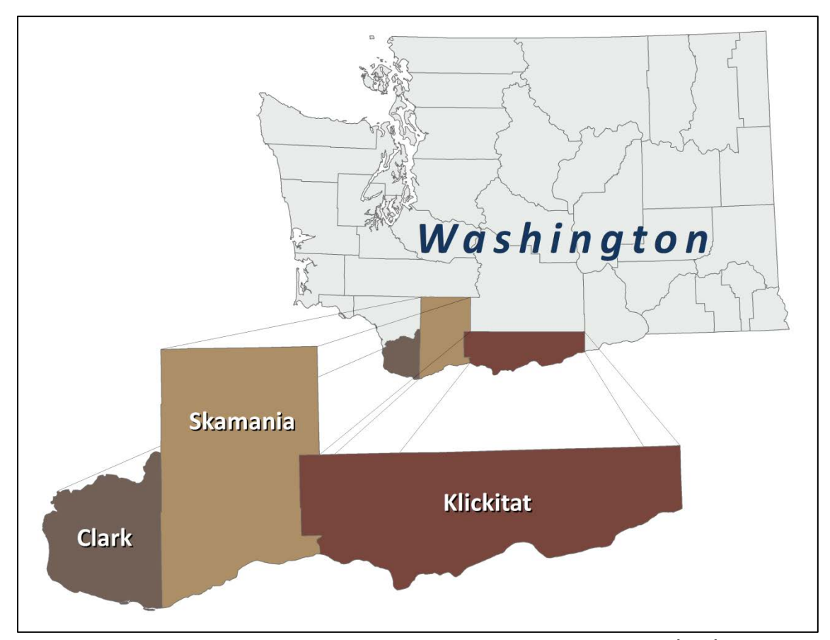
Figure 2: Southwest Washington Regional Transportation Council (RTC): Extent of Regional Transportation Planning Organization (Clark, Skamania and Klickitat counties).

Following passage of the Intermodal Surface Transportation Efficiency Act (ISTEA) in 1991, the region became a federally-designated Transportation Management Area (TMA) having a population of over 200,000. TMA status brings additional transportation planning requirements that the MPO must carry out. UPWP requirements are specified in 23CFR450.308 and 23CRF420.111.