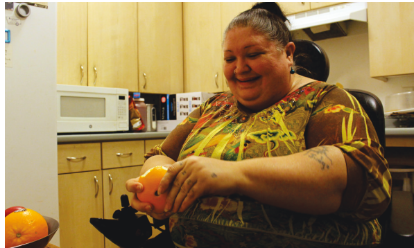
Leading with racial equity improves opportunities and outcomes for all historically marginalized communities in greater Portland.

Addressing the many disparities that stem from institutionalized inequity and exclusion will require much more than aspirational statements. That's why, in 2016, the Metro Council approved its Strategic Plan to Advance Racial Equity, Diversity and Inclusion.