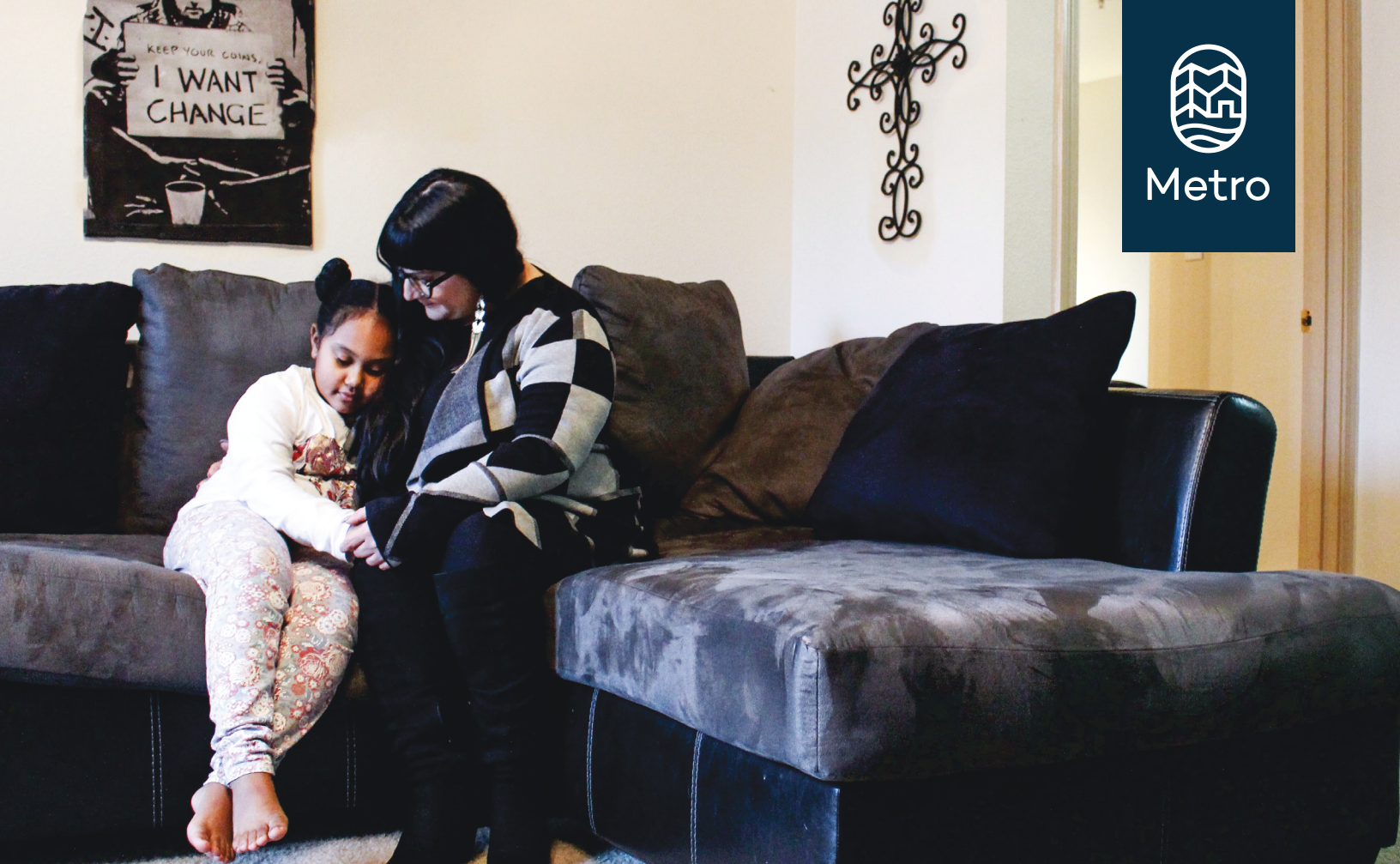
Exhibit A to Resolution No. 18-4895