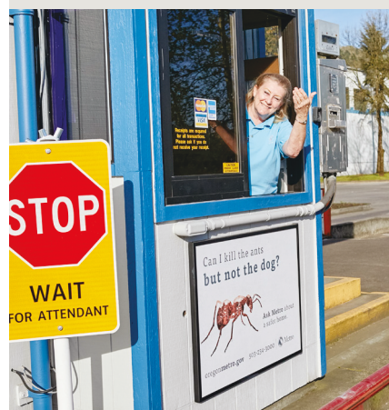
A Metro employee waves a garbage truck forward at Metro Central transfer station.

To enrich our communities and support our economy, Metro operates the Oregon Convention Center, Portland Expo Center and Portland's 5 Centers for the Arts.