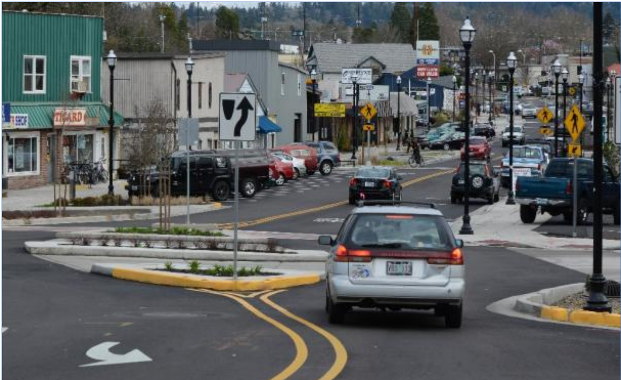
Main Street (Tigard, Oregon)