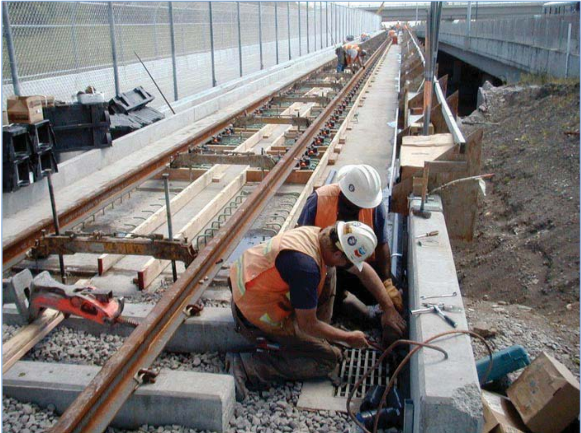
TriMet MAX - Orange Line Construction

For additional information regarding specific projects contained within this report, please contact the project sponsor.