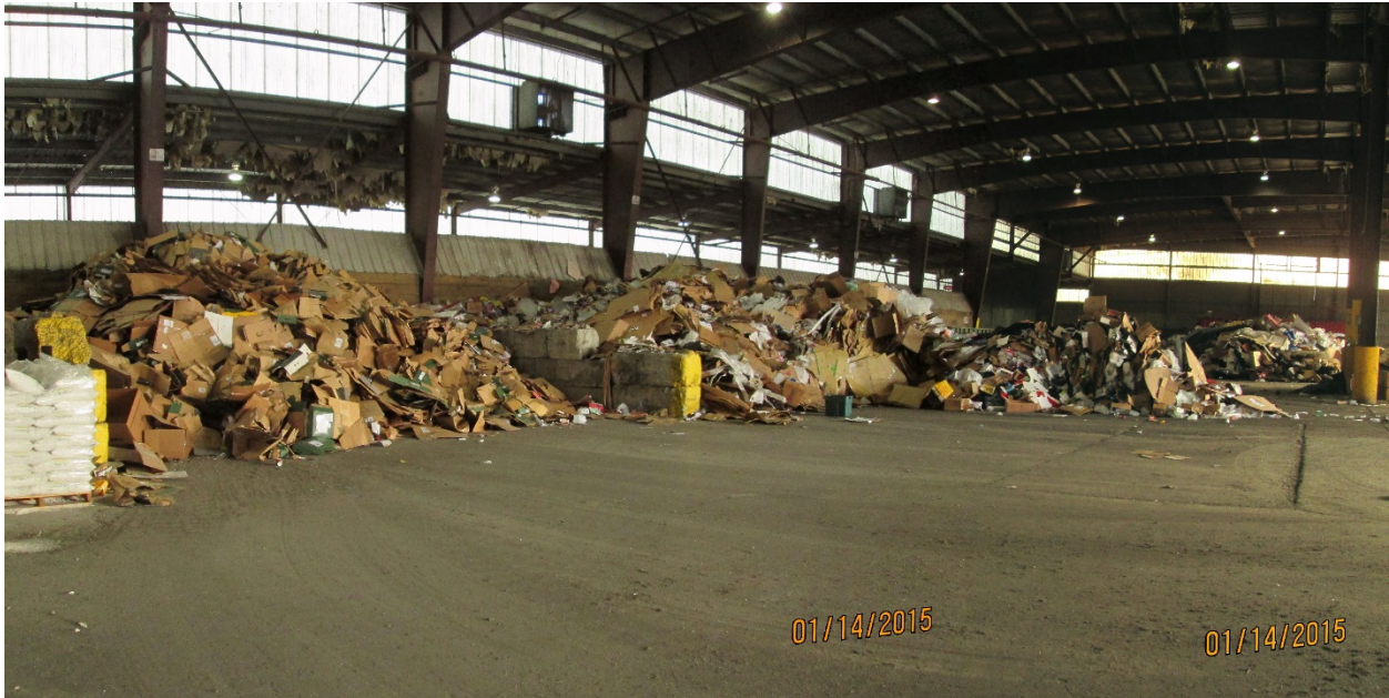
Photo 6: Troutdale Transfer Station located at 869 NW Eastwind Dr. in Troutdale

Attachment 1 to Staff Report for Resolution No. 19-5025