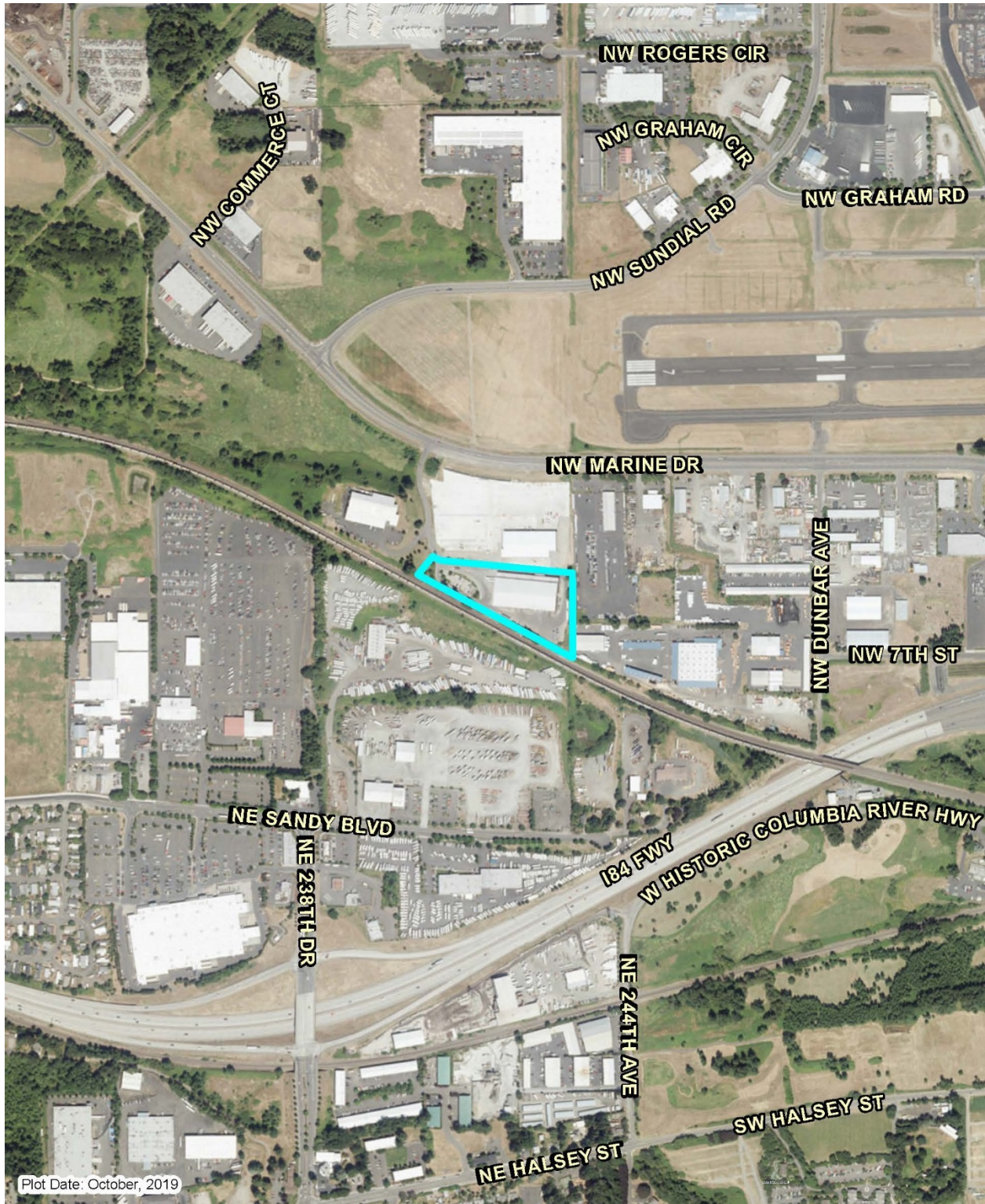
Photo 3: Aerial photo of Troutdale Transfer Station located at 869 NW Eastwind Dr. in Troutdale

Attachment 1 to Staff Report for Resolution No. 19-5025