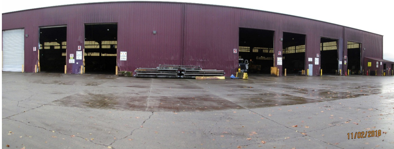
Photo 4: Troutdale Transfer Station located at 869 NW Eastwind Dr. in Troutdale

Attachment 1 to Staff Report for Resolution No. 19-5025