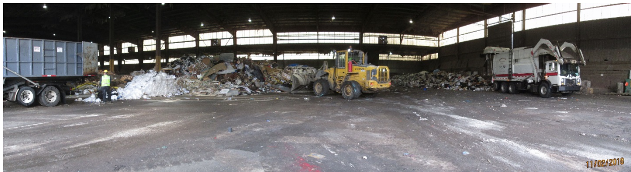
Photo 5: Troutdale Transfer Station located at 869 NW Eastwind Dr. in Troutdale