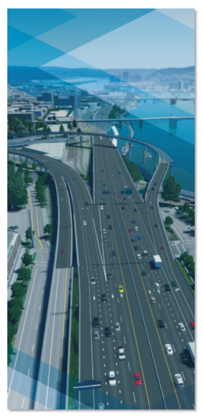
Figure 0-1 I-5 Rose Quarter Improvement Project Mainline

This Cost to Complete (CTC) report documents the approach and plan to deliver the Project within a projected cost and schedule, and describes the Project's design features, constructability, and the selected delivery method. This CTC report documents the Project's scope assumptions as part of the current cost estimate.