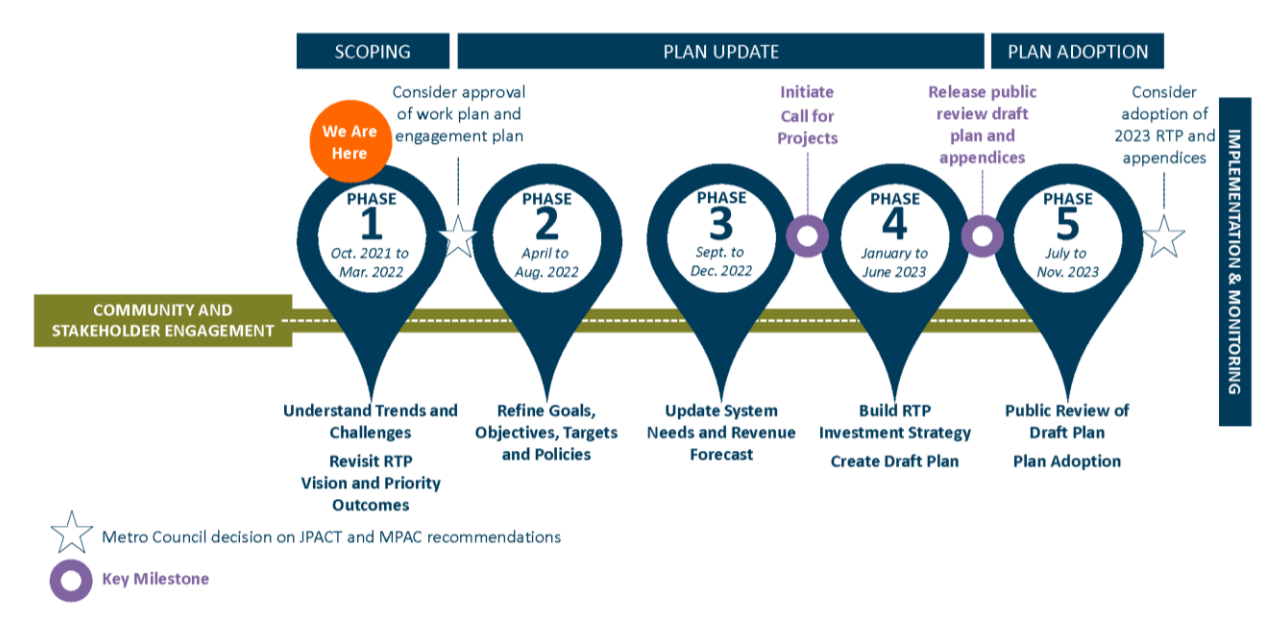
Figure 1. 2023 Regional Transportation Plan Timeline

In 2022 and 2023, Metro will work with the community, business groups and communitybased organizations across greater Portland and local, regional, state and federal partners to update the RTP as shown in Figure 1.