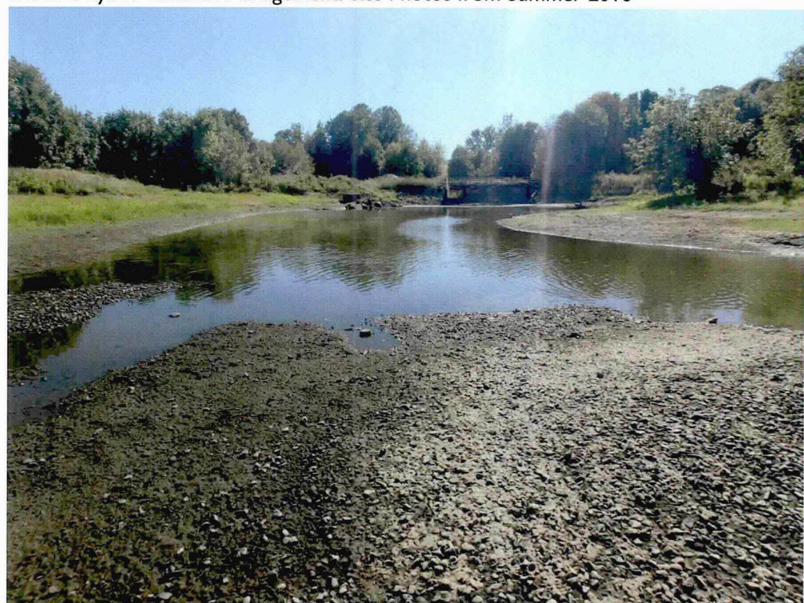
Photo I: Channel upstream of Water Control Structure, approximately station 2+00 (August 15, 2016)