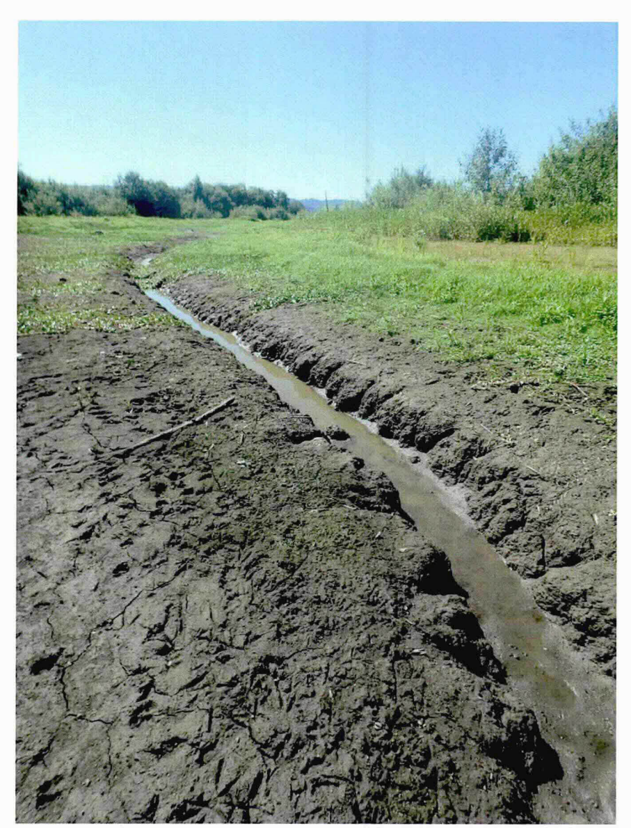
Photo 5: Existing channel at approx. station 44+00, looking towards lake (August 15, 2016)