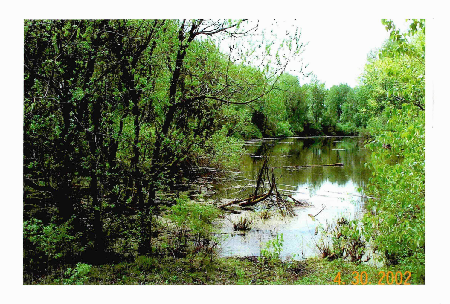
Figure 2. Blind slough used by western painted turtles, viewed from the base of the informal canoe slide. Note the woody debris used for basking by turtles. The surrounding riparian forest is dominated by black cottonwood, bigleaf maple and other typical riparian gallery forest plants.