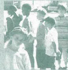
Bethel Neighborhood Drop-In Center