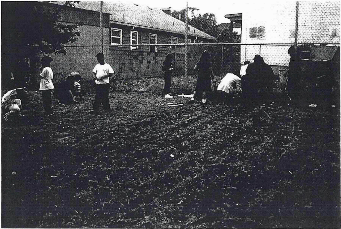
Students help weed and plant the Humboldt Learning Garden.

NECDC and other sponsors were recognized during the ground breaking ceremony on May 30, 1997.