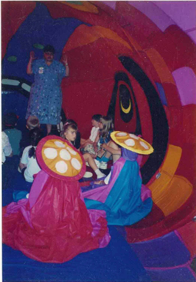
Children with story teller @ Salmon Display