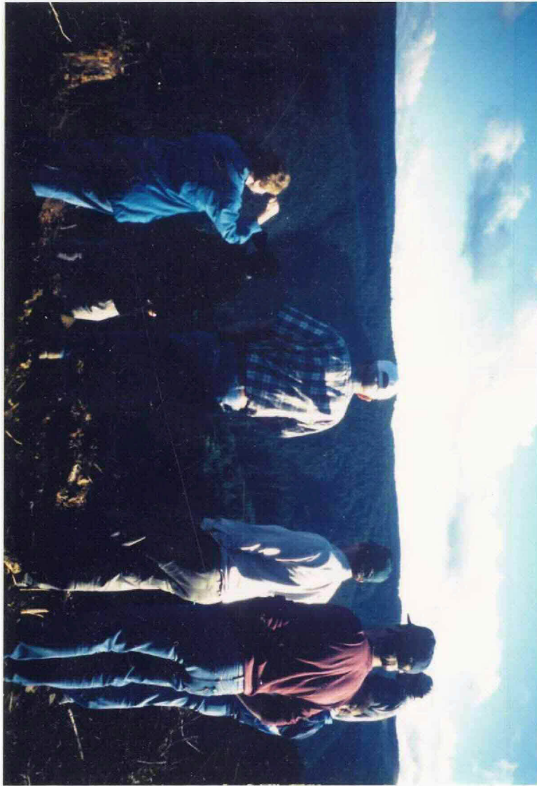
Oregon Department of Forestry leading a tour of Hagg Lake Watershed →