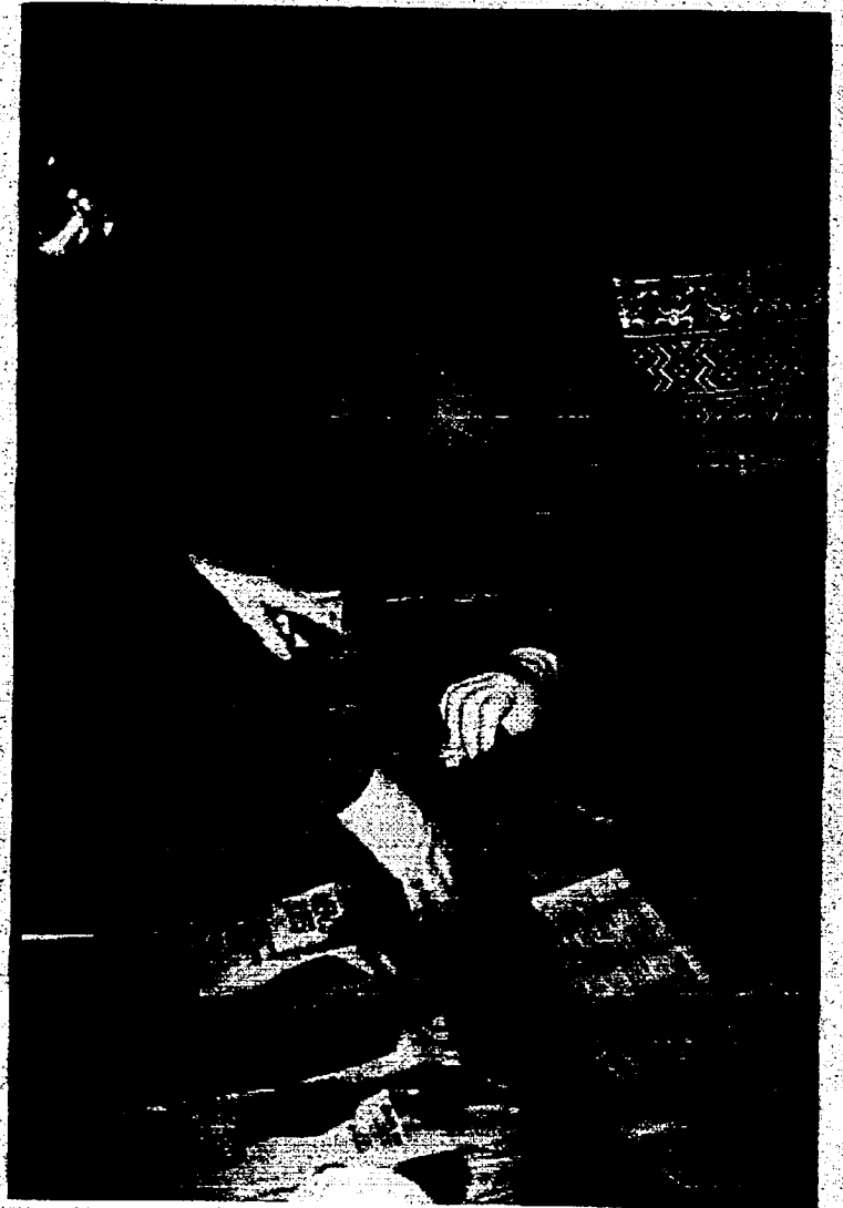
SALMON GO TO SCHOOL TEACHER WORKSHOP