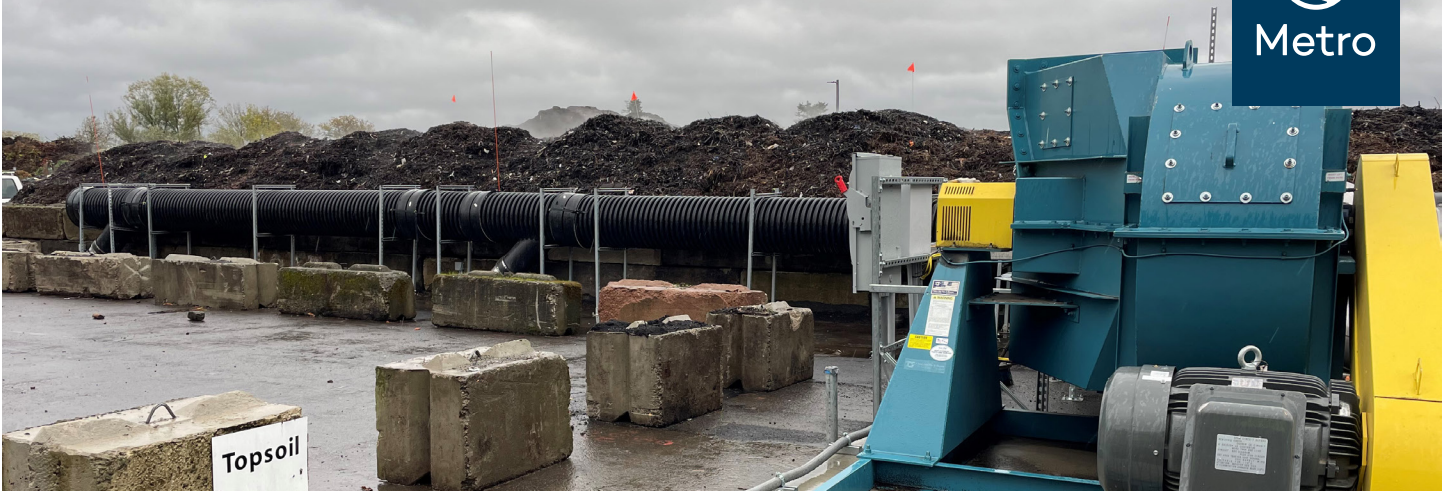
Recology Oregon Compost