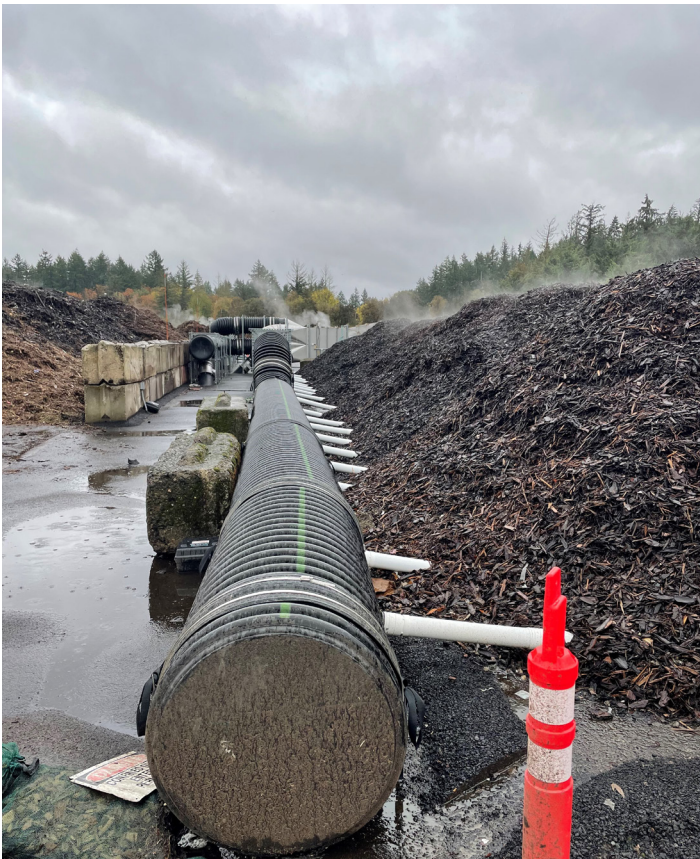
Recology Oregon Compost

three months of operating the new system, the amount of processed materials increased by 34 percent as compared to the same period the prior year. Upgrades from the grant improves service equity, as more capacity is needed for more cities to be able to collect food scraps for composting.