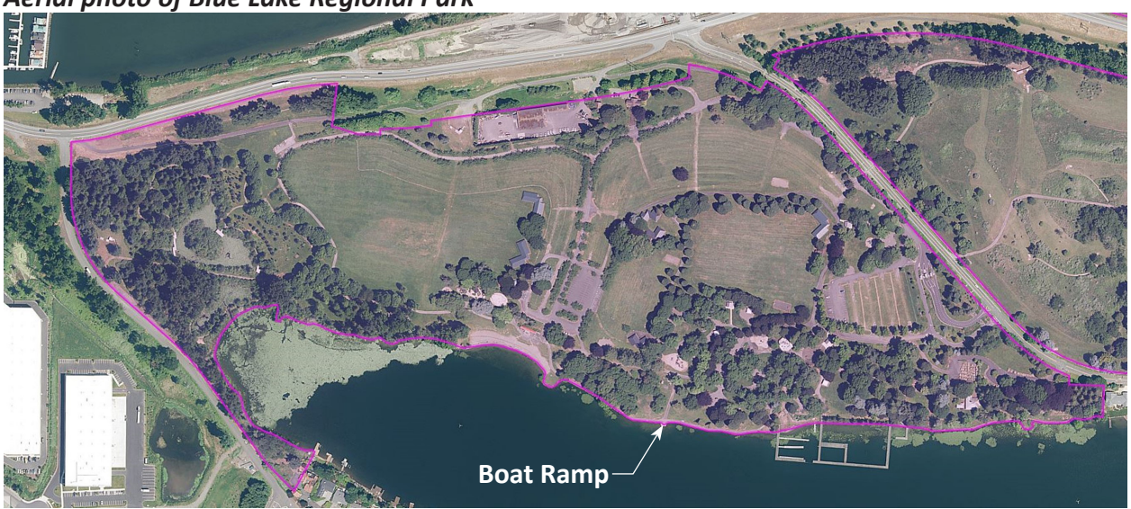
Aerial photo of Blue Lake Regional Park Boat Ramp