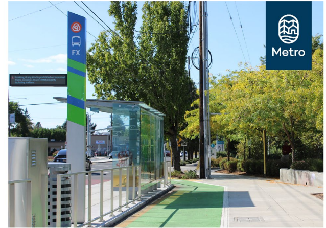
Exhibit A to Resolution 24-5415