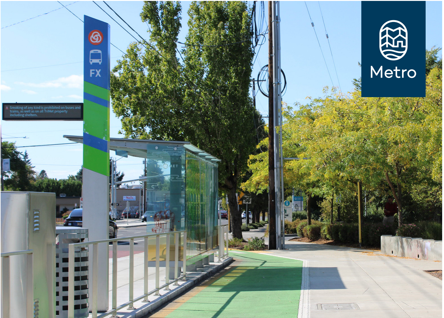
Exhibit A to Resolution 24-5415