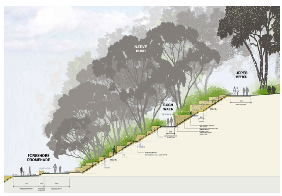
Figure 4, Tiered paths at Barangaroo.

Three different paths provide space for cyclists and walkers alike. The foreshore promenade provides separate pedestrian and bicycle paths with access to the harbor, while the bush walk and upper bluff provide more secluded walking paths. (PWP 2015)