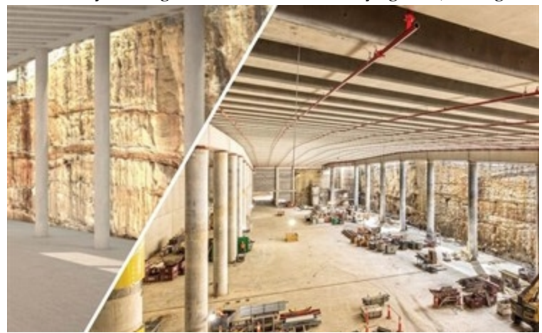
Figure 5, The Cutaway provides a versatile underground entertainment space.

The cutaway at Barangaroo Reserve is a large underground cultural space that also includes a parking garage. This space will be used for community events and festivals. Natural light is used extensively through the installation of skylights. (Barangaroo Delivery Authority 2013)