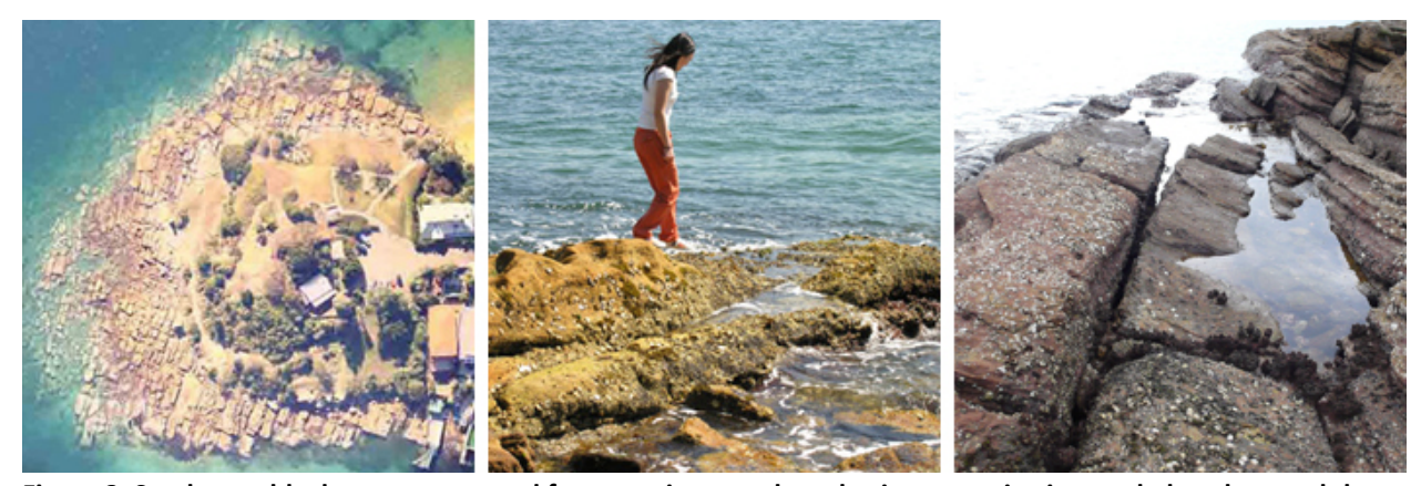
Figure 3, Sandstone blocks were extracted from on-site, weathered using water jetting, and placed around the margins of Barangaroo Reserve.

10,000 sandstone blocks were extracted from the site and placed around the margins of Barangaroo Reserve. Water jetting was used to soften the block edges and provide a more natural surface. The stepped arrangement of these blocks provides tide pools and substrate for marine life, while also providing easy access for visitors to connect with Sydney Harbor and the marine life therein. (PWP 2015)