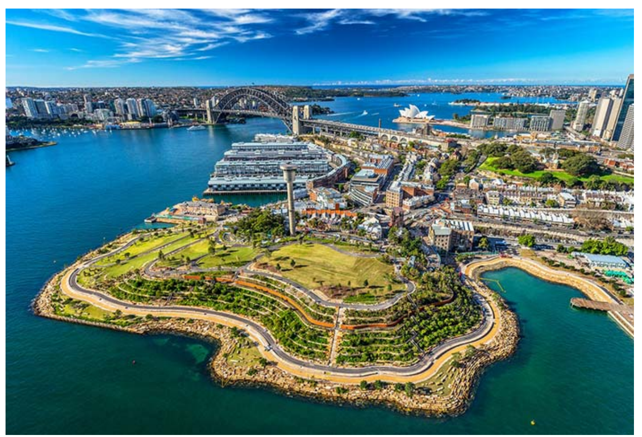
Figure 1, Barangaroo reserve overview.