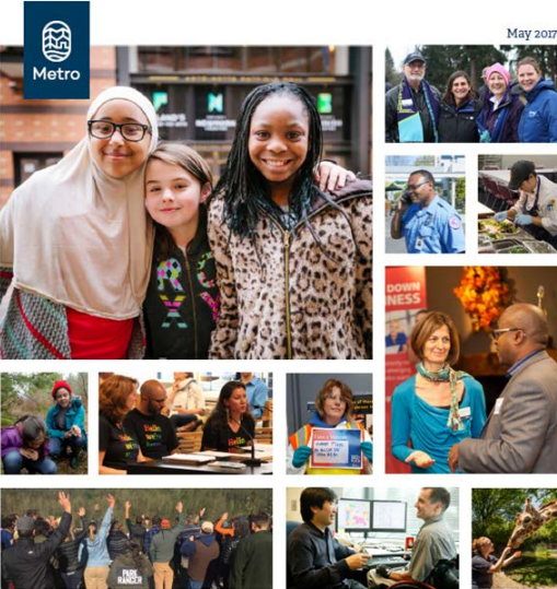
Diversity Action Plan