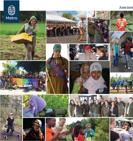
Strategic plan to advance racial equity, diversity and inclusion