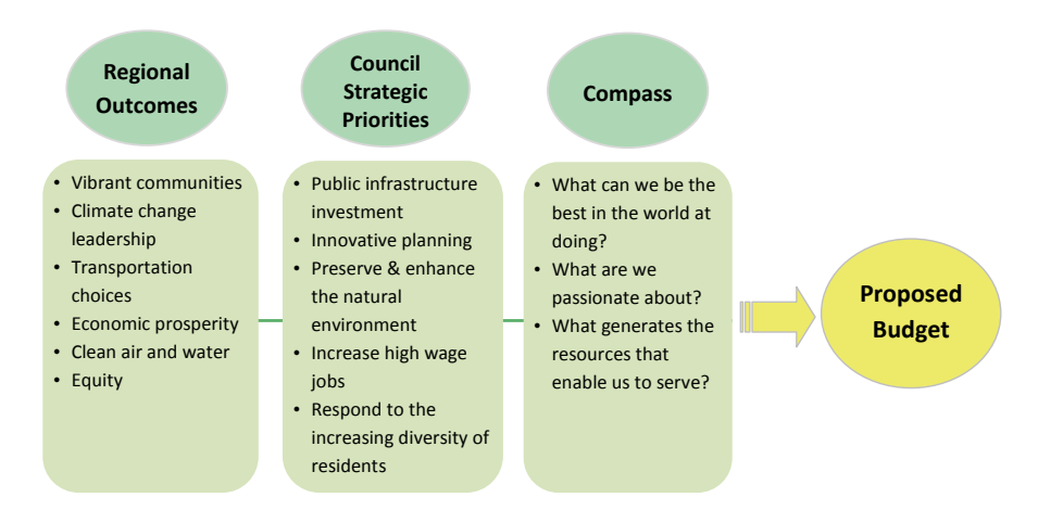
Exhibit 4 Metro's framework for budget decisions