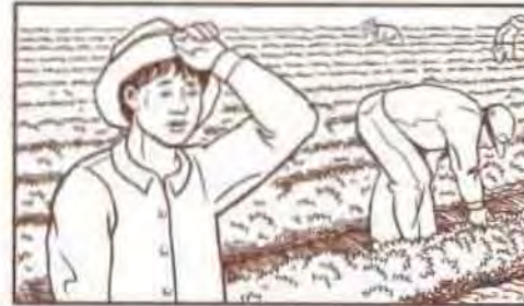
Diagram #2. Health Effects of Heat