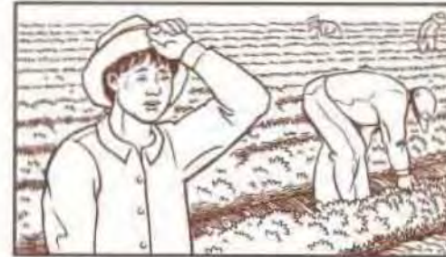
Diagram #1. Preventing Heat Illness